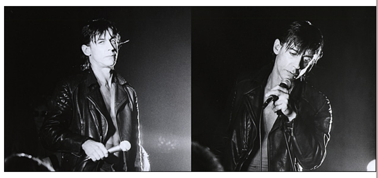
Show me 'slightly annoyed.' Good. Now show me your best crooner. Good. Now show me vour dick!